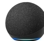
- Amazon Alexa